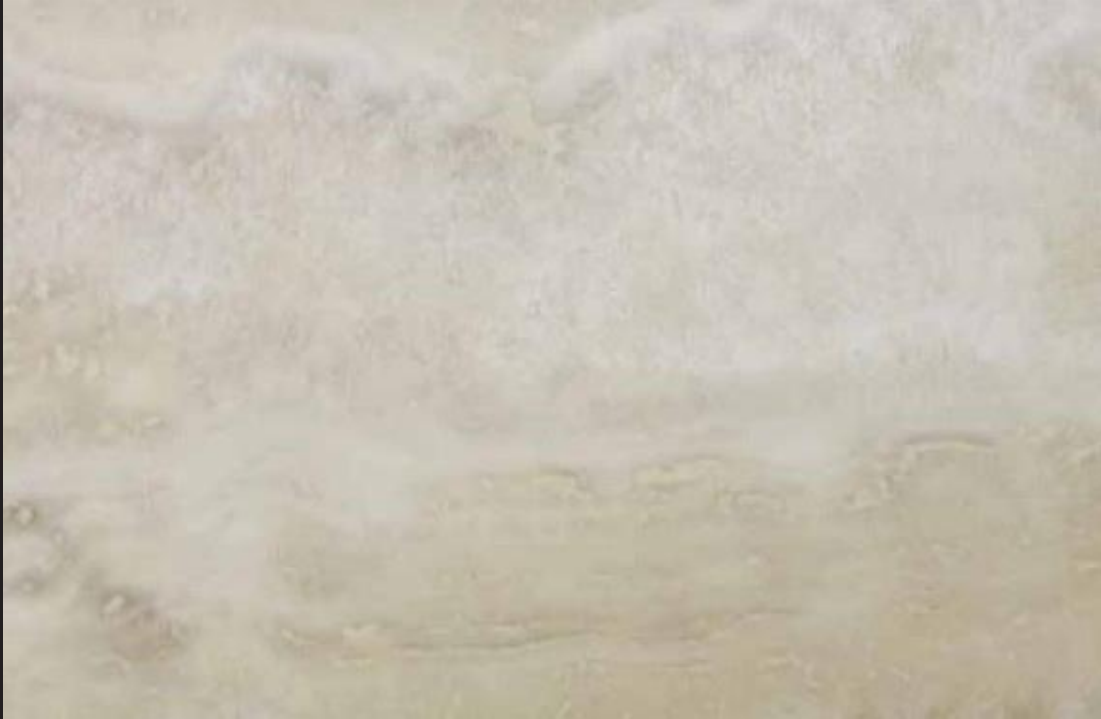
Aegean Travertine Ivory - 742915