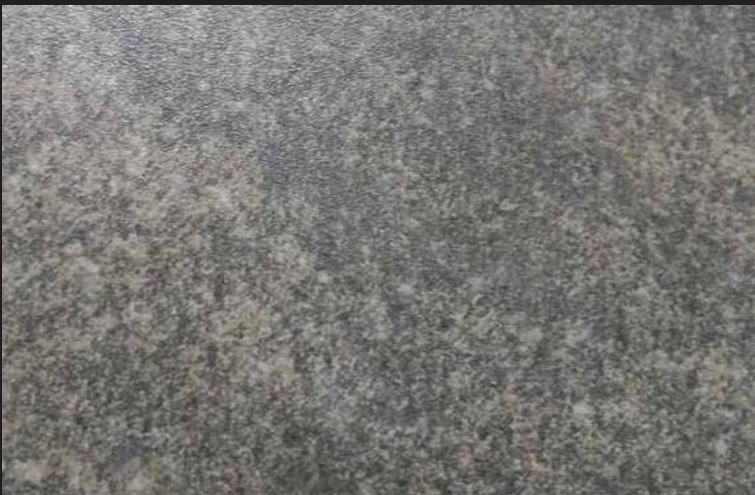
Sandstone Steel - 48817