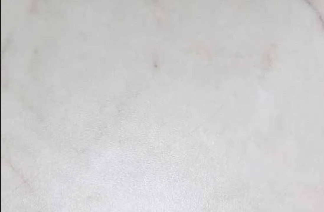
Carrara White - 46513

Embossing: Satin / Thickness: 5.00mm / Wear Layer: 0.55mm / Coating: Ceramic Bead / Utilization Class: 33/42 / Produced with 100% pure vinyl. Does not contain recycled material and therefore all contents conform to EU standards. EasyLock itself can be completely recycled.