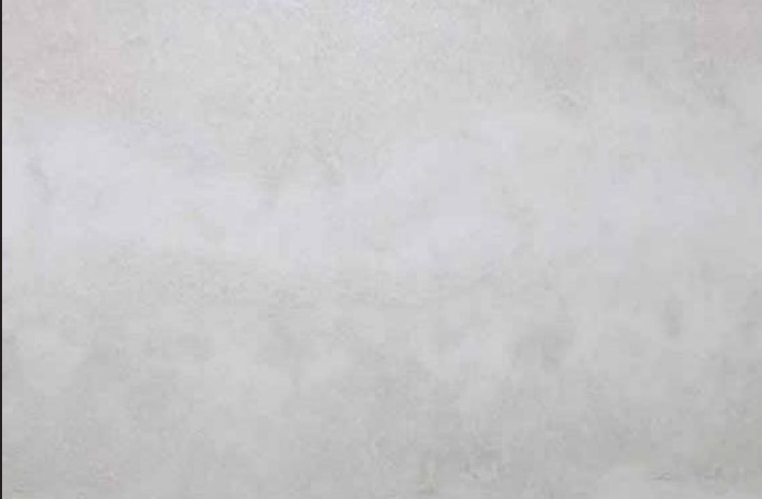
Aegean Travertine White - 742913

Embossing: Satin / Thickness: 5.00mm / Wear Layer: 0.55mm / Coating: Ceramic Bead / Utilization Class: 33/42 / Produced with 100% pure vinyl. Does not contain recycled material and therefore all contents conform to EU standards. EasyLock itself can be completely recycled.