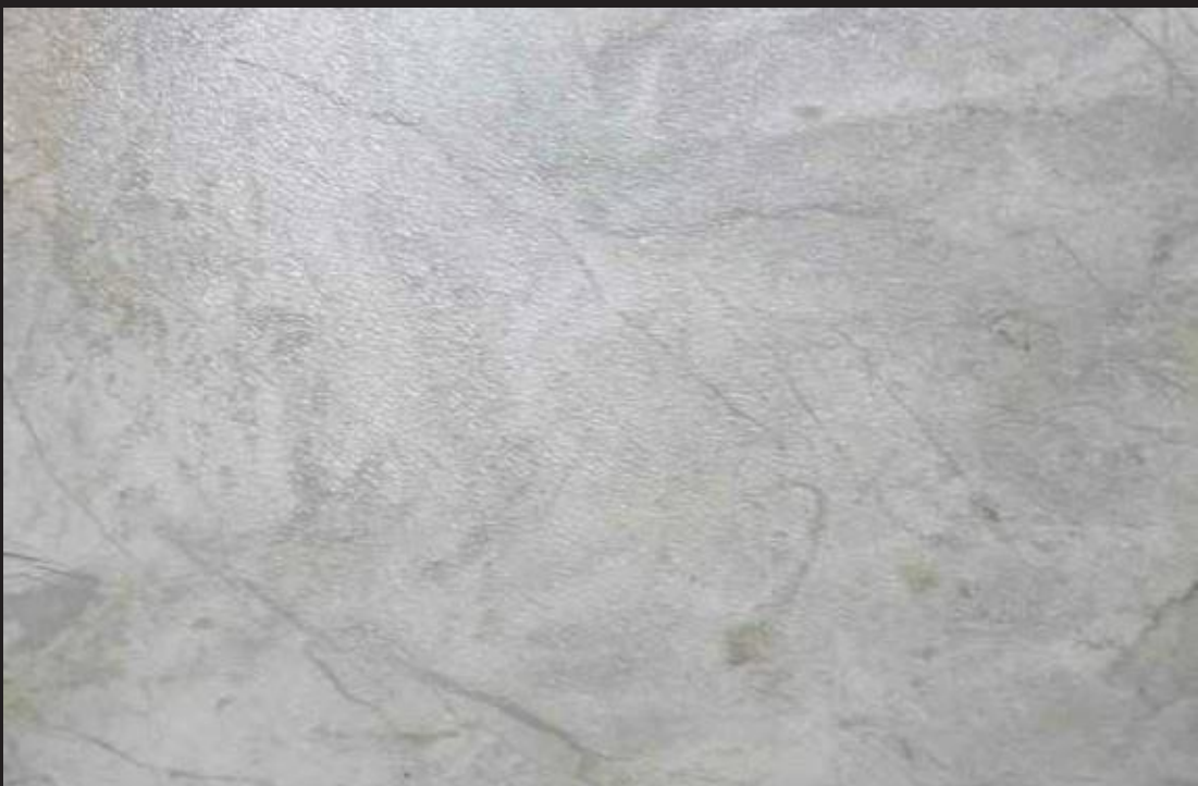
New Marble Grey - 46413