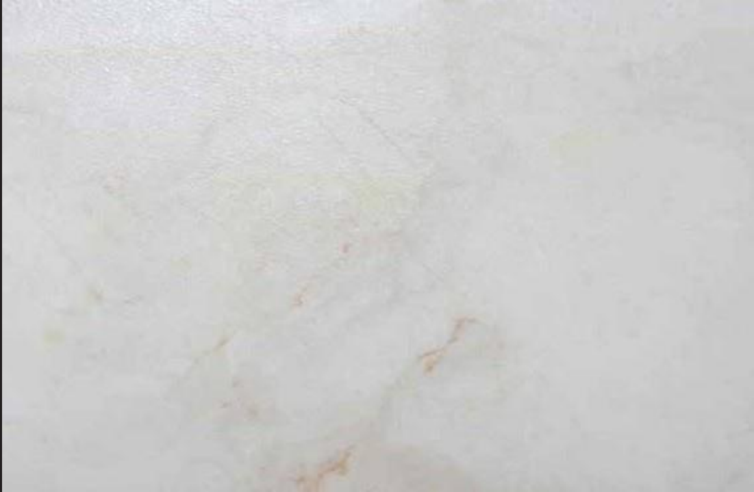
New Marble Crema - 46415