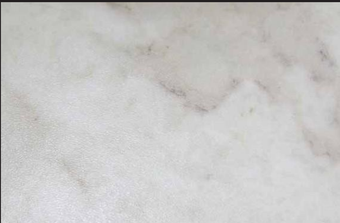
Carrara Oyster - 46514