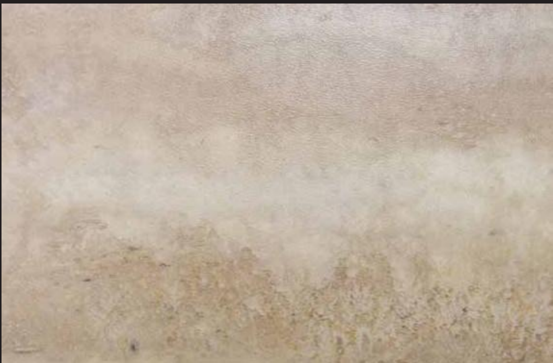
Aegean Travertine Noche - 742917