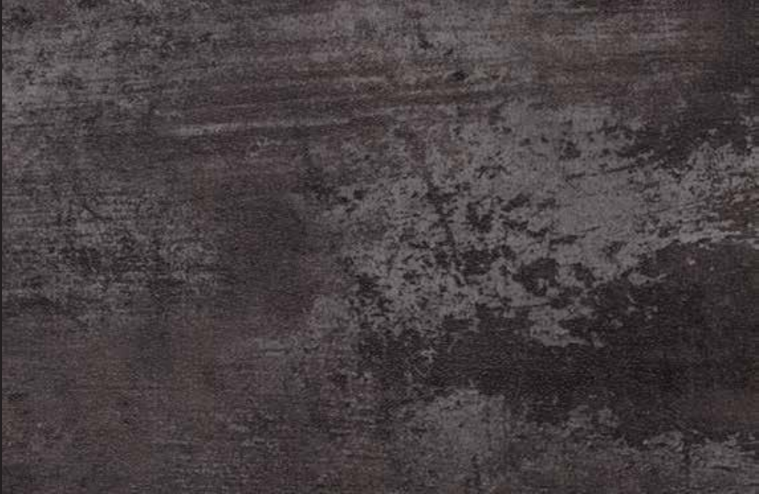
Espana Cadiz - 35713