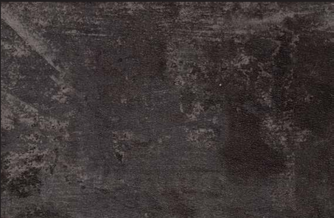
Espana Toledo - 35711